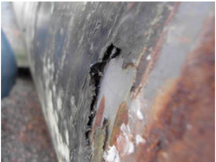
Close up of HDPE pipe coating