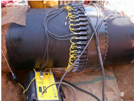
FOCUS+ used to inspect the 61 cm (24 in) buried pipeline through HDPE coating

The greatest challenge facing the inspection team was the trilaminate pipe coating made from fusion-bonded epoxy (FBE), adhesive, and an outer layer of high-density polyethylene (HDPE).