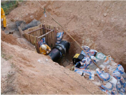
Location photo of typical excavation

Teletest™ FOCUS+ guided wave ultrasonic testing was used to inspect the 61 cm (24 in) line, buried 3–5 m (9.8–16.4 ft), and identify areas for possible follow-up inspection.