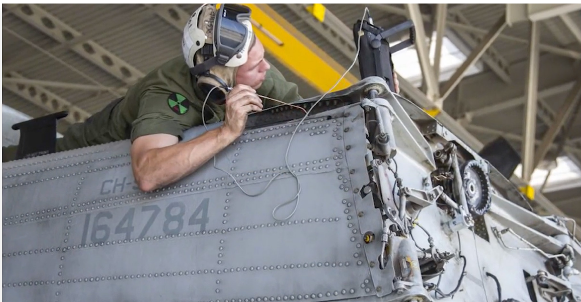
Crack Detection Around Fasteners

Use digital conductivity measurements (resistivity) to characterize/sort materials. Directly measure the conductivity of metals and alloys, such as aluminum structures, using dedicated conductivity probes that have a broad operating frequency range. Or measure a nonconductive coating such as paint. The MIZ-21C offers a wide measurement range for both conductivity and thickness.